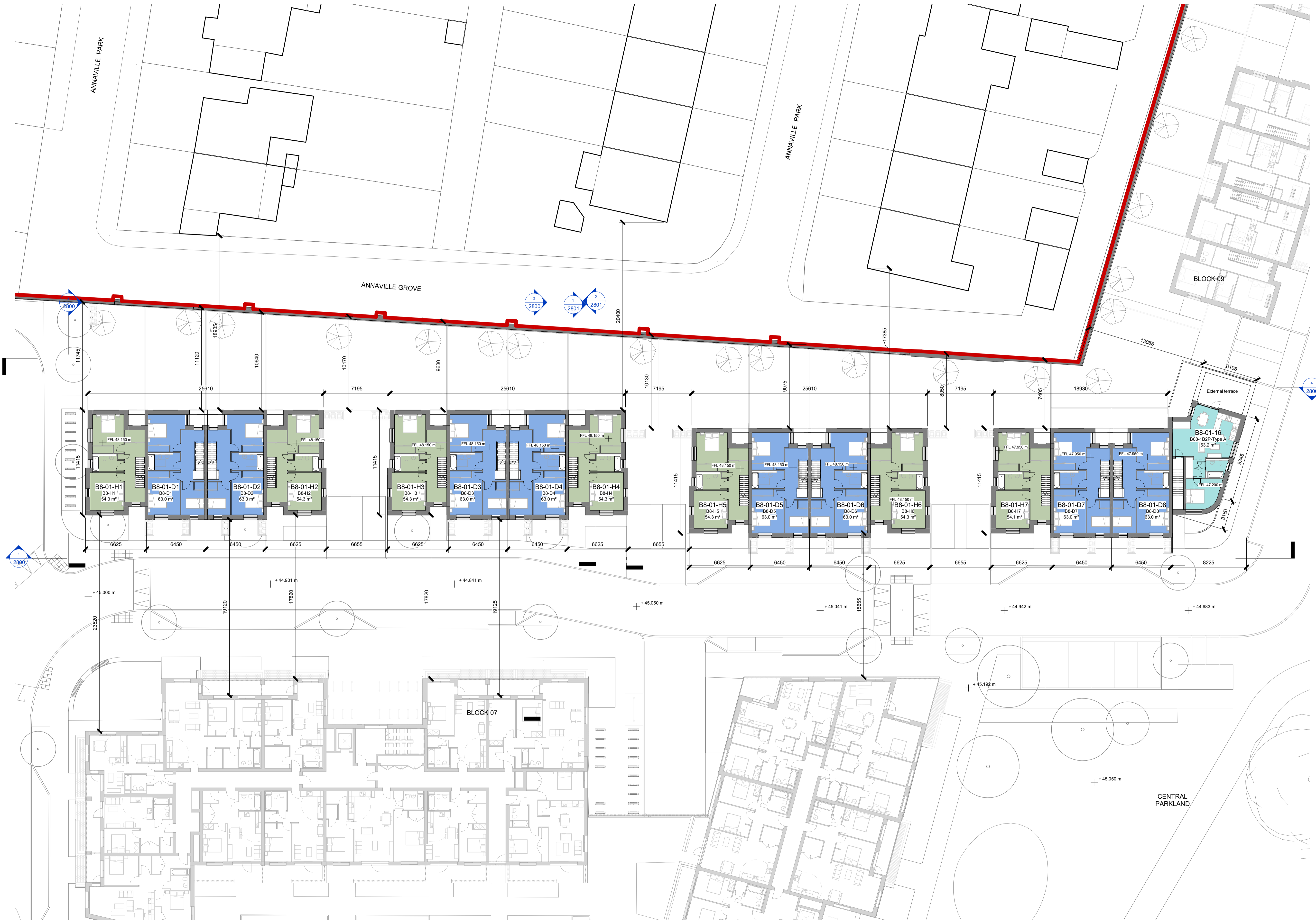
B8_01 - First Floor Plan 1:200

Notes: - Do not scale from this drawing. Use figured dimensions in all cases. - Verify dimensions on site and report any discrepancies to the Architect immediately. - This drawing to be read in conjunction with the Architect's Specification. - © This drawing is copyright and may only be reproduced with the Architect's permission.